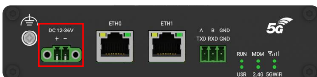
2-pin 3.5 mm Terminal Block with Lock