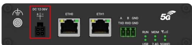
4-pin Micro-Fit Socket